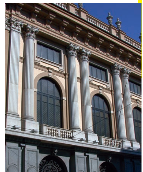
Palazzo Perrone di San Martino, headquarters of the Fondazione CRT

This project is implemented through lessons, courses and shows offered free to all the schools in the area.