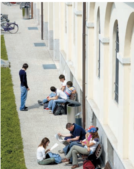
Student life at the Faculty of Economics in Novara

This is a starting point, though; we want to become competitive in attracting private business and money and in technological transfer. This is the challenge of the next years."